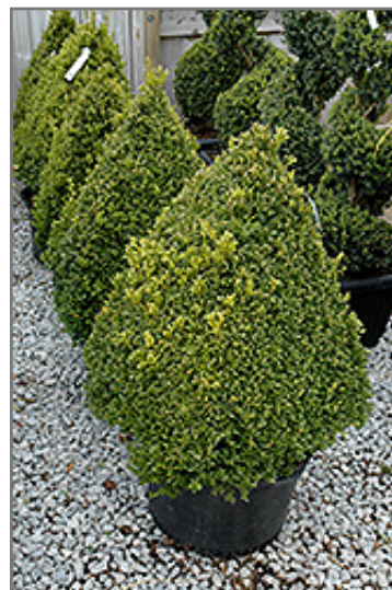
Green Mountain Boxwood (pyramid form)