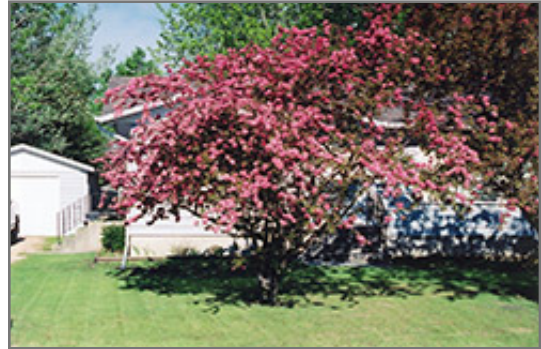
Almey Flowering Crab in bloom

Almey Flowering Crab is recommended for the following landscape applications;