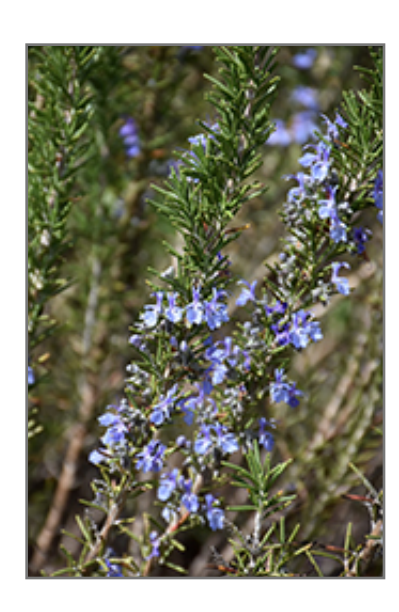
Gold Dust Rosemary flowers

Aside from its primary use as an edible, Gold Dust Rosemary is sutiable for the following landscape applications;