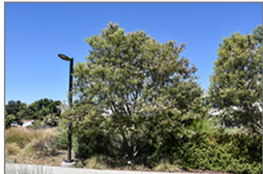
Timeless Beauty Desert Willow in bloom

Timeless Beauty Desert Willow is a fine choice for the yard, but it is also a good selection for planting in outdoor pots and containers. Its large size and upright habit of growth lend it for use as a solitary accent, or in a composition surrounded by smaller plants around the base and those that spill over the edges. It is even sizeable enough that it can be grown alone in a suitable container. Note that when grown in a container, it may not perform exactly as indicated on the tag - this is to be expected. Also note that when growing plants in outdoor containers and baskets, they may require more frequent waterings than they would in the yard or garden.