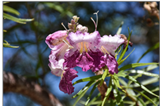
Timeless Beauty Desert Willow flowers

This tree will require occasional maintenance and upkeep, and should only be pruned after flowering to avoid removing any of the current season's flowers. Deer don't particularly care for this plant and will usually leave it alone in favor of tastier treats. Gardeners should be aware of the following characteristic(s) that may warrant special consideration;