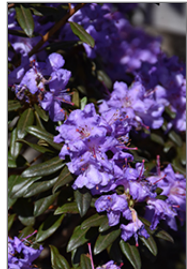
Grape Jam Rhododendron flowers

Grape Jam Rhododendron will grow to be about 3 feet tall at maturity, with a spread of 24 inches. It tends to be a little leggy, with a typical clearance of 1 foot from the ground. It grows at a slow rate, and under ideal conditions can be expected to live for 40 years or more.