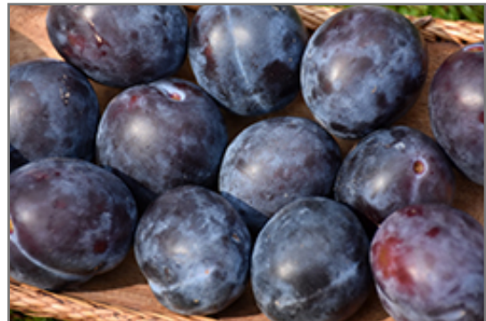
Mount Royal Plum fruit