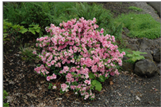
Gumpo Pink Azalea in bloom