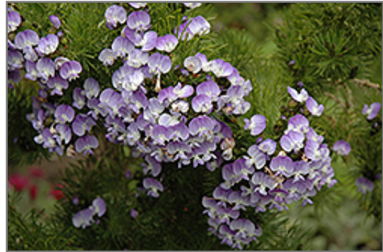
African Scurf Pea flowers