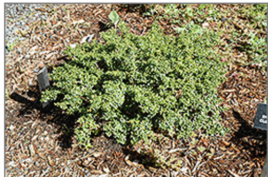
Lemon Gem Dwarf Japanese Holly