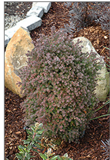
Red Star Whitecedar