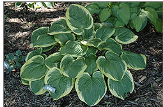
Mint Julep Hosta