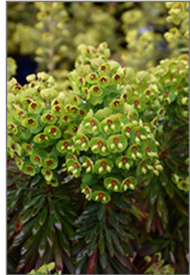
Tiny Tim Spurge flowers

Tiny Tim Spurge is recommended for the following landscape applications;