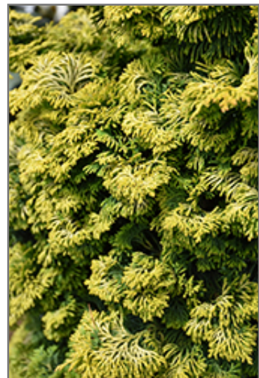
Dwarf Golden Hinoki Falsecypress foliage