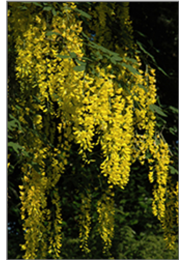
Weeping Laburnum flowers