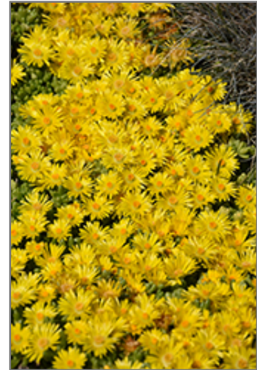
Yellow Ice Plant flowers

Yellow Ice Plant is recommended for the following landscape applications;