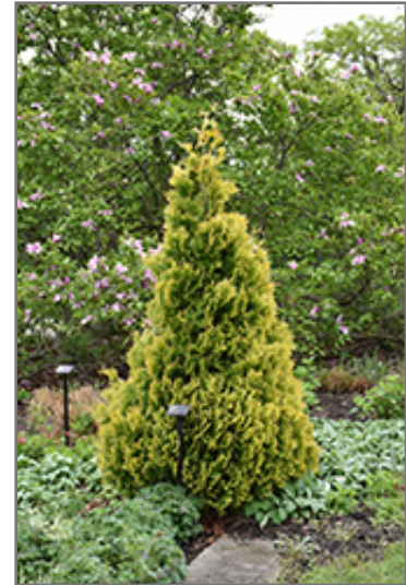
Gold Drop Arborvitae