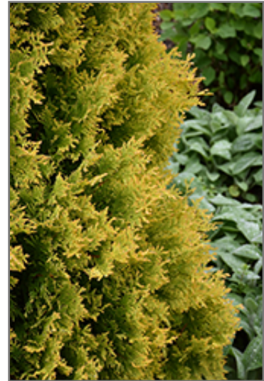
Gold Drop Arborvitae foliage

This shrub does best in full sun to partial shade. It prefers to grow in average to moist conditions, and shouldn't be allowed to dry out. It is not particular as to soil type or pH. It is somewhat tolerant of urban pollution, and will benefit from being planted in a relatively sheltered location. Consider applying a thick mulch around the root zone in winter to protect it in exposed locations or colder microclimates. This is a selection of a native North American species.