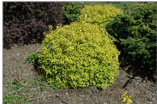
Lemon Princess Spirea