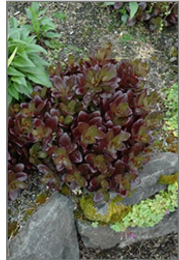
Chocolate Drop Stonecrop

Chocolate Drop Stonecrop is a dense herbaceous perennial with an upright spreading habit of growth. Its relatively coarse texture can be used to stand it apart from other garden plants with finer foliage.