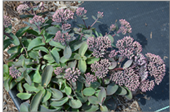
Chocolate Drop Stonecrop flower buds