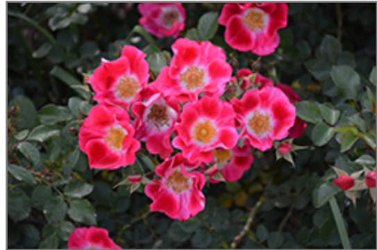
Carefree Spirit Rose flowers

Carefree Spirit Rose is recommended for the following landscape applications;