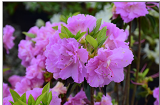
Elsie Lee Azalea flowers