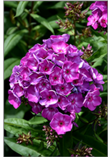
Grape Lollipop Garden Phlox flowers

Grape Lollipop Garden Phlox is recommended for the following landscape applications;