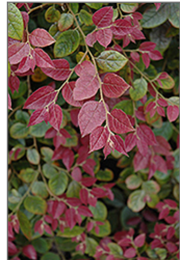
Razzleberri Fringeflower foliage