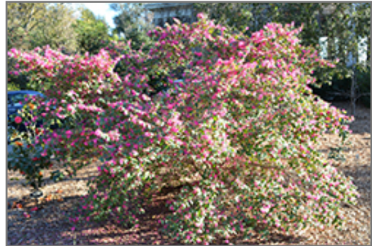
Razzleberri Fringeflower in bloom

This shrub does best in full sun to partial shade. It prefers to grow in average to moist conditions, and shouldn't be allowed to dry out. It is particular about its soil conditions, with a strong preference for rich, acidic soils. It is somewhat tolerant of urban pollution. Consider applying a thick mulch around the root zone in winter to protect it in exposed locations or colder microclimates. This is a selected variety of a species not originally from North America.