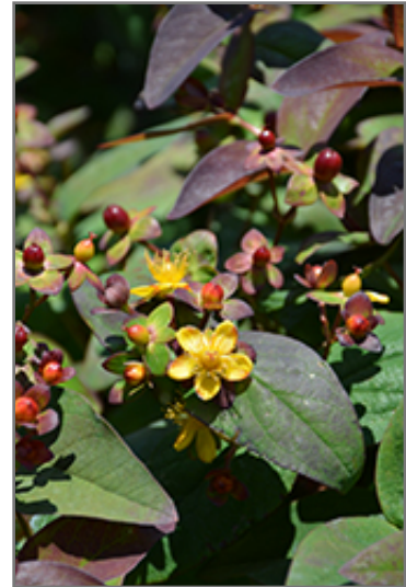
Albury Purple St. John's Wort flowers