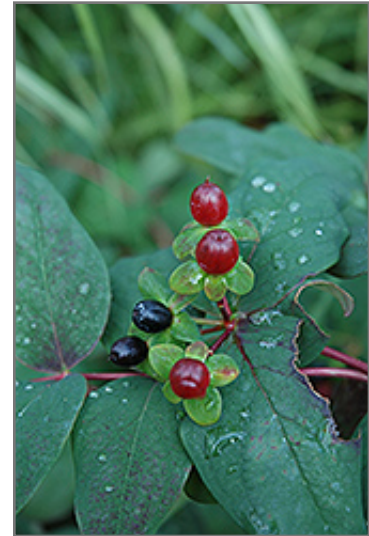
Albury Purple St. John's Wort fruit

Albury Purple St. John's Wort makes a fine choice for the outdoor landscape, but it is also well-suited for use in outdoor pots and containers. With its upright habit of growth, it is best suited for use as a 'thriller' in the 'spiller-thriller-filler' container combination; plant it near the center of the pot, surrounded by smaller plants and those that spill over the edges. It is even sizeable enough that it can be grown alone in a suitable container. Note that when grown in a container, it may not perform exactly as indicated on the tag - this is to be expected. Also note that when growing plants in outdoor containers and baskets, they may require more frequent waterings than they would in the yard or garden.