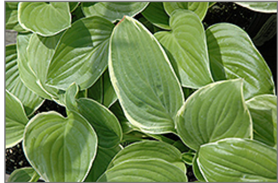
Frozen Margarita Hosta foliage

Frozen Margarita Hosta is recommended for the following landscape applications;