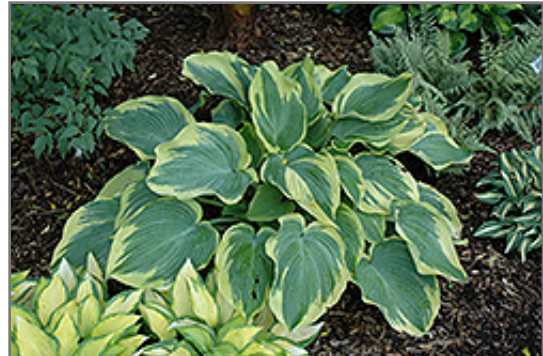
Earth Angel Hosta