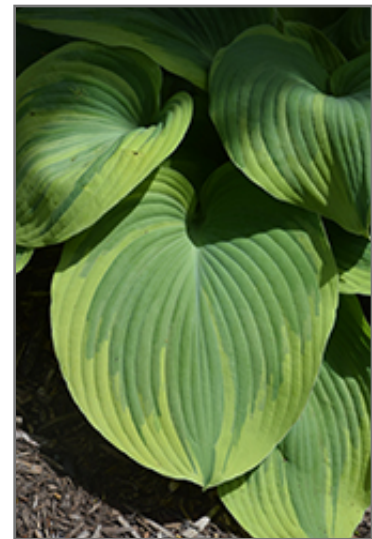
Earth Angel Hosta foliage