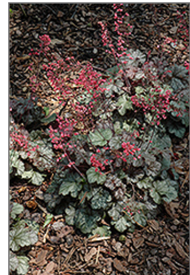
Mysteria Coral Bells in bloom