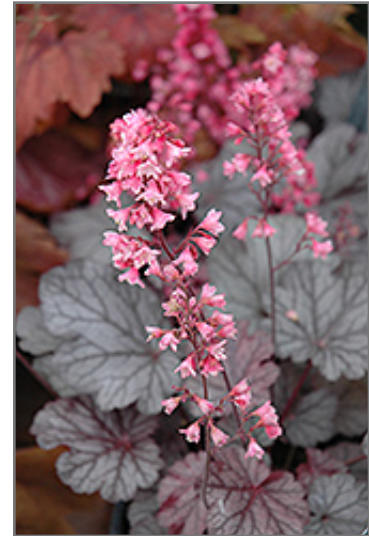
Milan Coral Bells flowers

Milan Coral Bells is recommended for the following landscape applications;