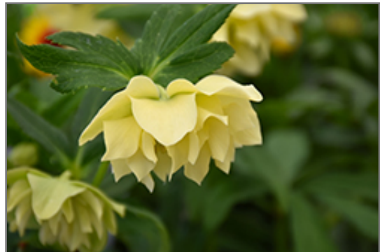
Golden Lotus Hellebore flowers