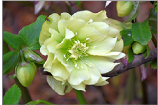
Golden Lotus Hellebore flowers

Golden Lotus Hellebore is recommended for the following landscape applications;