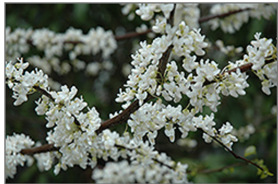
White Redbud flowers