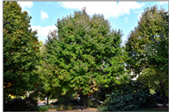
Autumn Flame Red Maple

This tree should only be grown in full sunlight. It is quite adaptable, preferring to grow in average to wet conditions, and will even tolerate some standing water. It is not particular as to soil type, but has a definite preference for acidic soils, and is subject to chlorosis (yellowing) of the foliage in alkaline soils. It is somewhat tolerant of urban pollution. This is a selection of a native North American species.