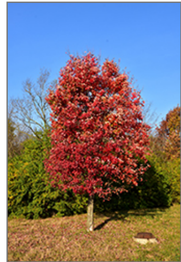
Autumn Flame Red Maple in fall