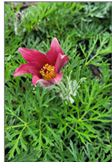
Red Pasqueflower flowers