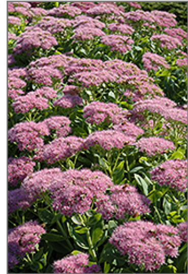
Brilliant Stonecrop flowers

Brilliant Stonecrop is recommended for the following landscape applications;