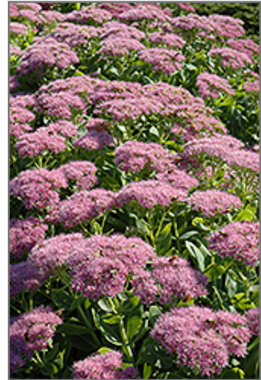
Brilliant Stonecrop flowers

Brilliant Stonecrop is recommended for the following landscape applications;