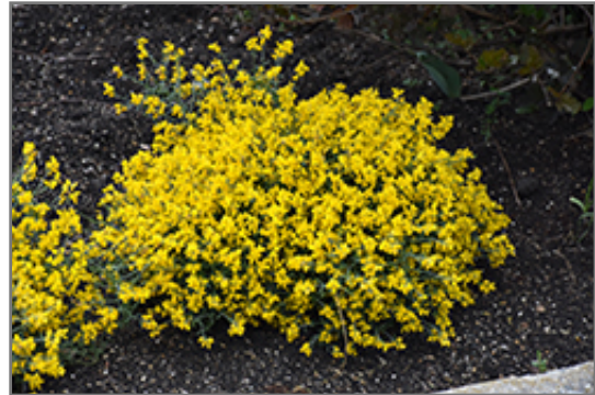
Bangle Dyers Greenwood in bloom