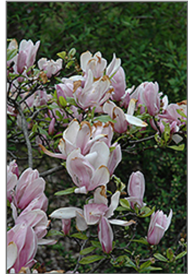
George Henry Kern Magnolia flowers