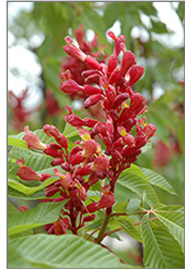
Red Buckeye flowers