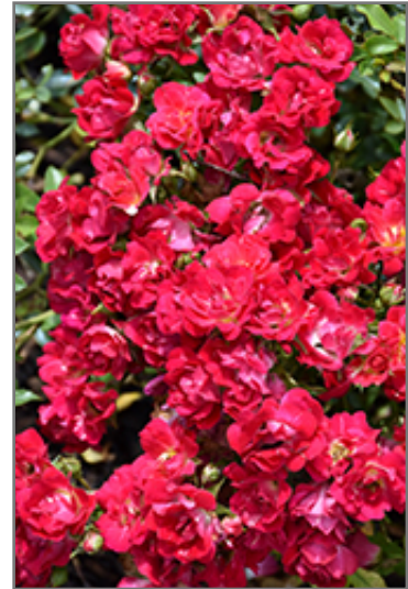
Red Drift Rose flowers

Red Drift Rose is recommended for the following landscape applications;