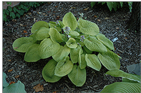
Zounds Hosta in bloom