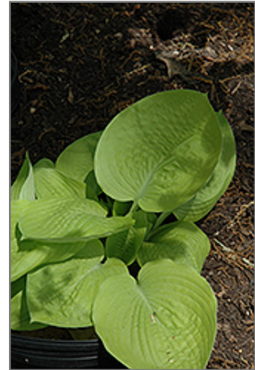
Zounds Hosta foliage