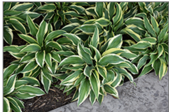
Wolverine Hosta