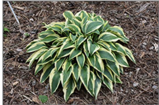
Wolverine Hosta

This plant does best in partial shade to shade. It prefers to grow in average to moist conditions, and shouldn't be allowed to dry out. It is not particular as to soil type or pH. It is somewhat tolerant of urban pollution. This particular variety is an interspecific hybrid. It can be propagated by division; however, as a cultivated variety, be aware that it may be subject to certain restrictions or prohibitions on propagation.