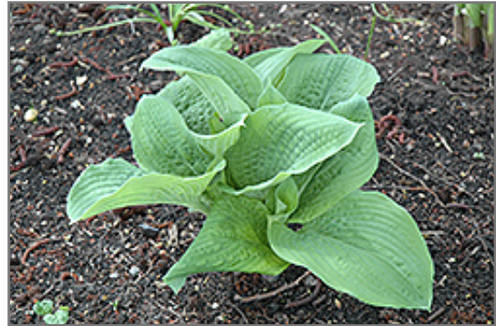
Bigfoot Hosta