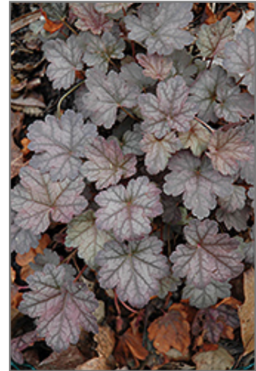
Dolce Mocha Mint Coral Bells foliage

Dolce Mocha Mint Coral Bells is recommended for the following landscape applications;