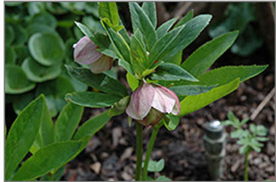
Blackthorn Hybrid Hellebore flowers