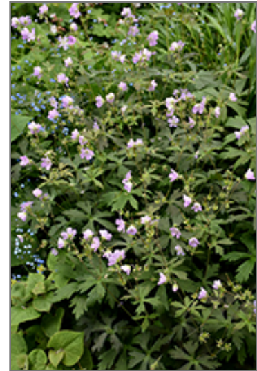
Espresso Cranesbill in bloom

Espresso Cranesbill is a fine choice for the garden, but it is also a good selection for planting in outdoor pots and containers. It is often used as a 'filler' in the 'spiller-thriller-filler' container combination, providing a mass of flowers and foliage against which the thriller plants stand out. Note that when growing plants in outdoor containers and baskets, they may require more frequent waterings than they would in the yard or garden.