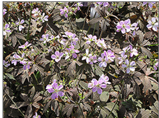
Espresso Cranesbill flowers