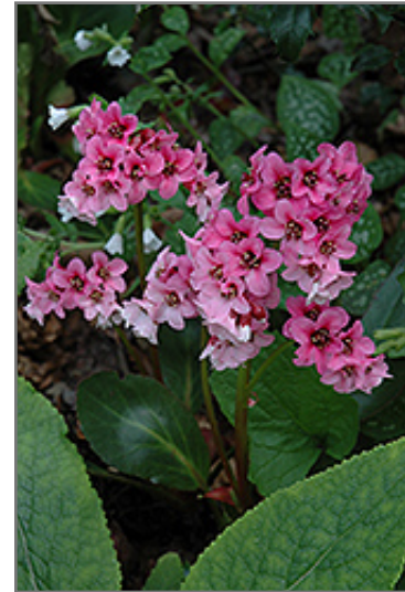
Pink Dragonfly Bergenia flowers