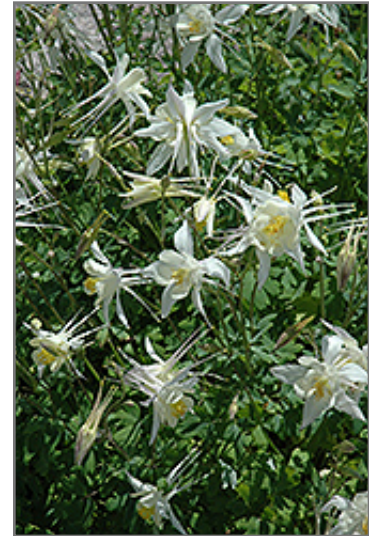
Kristall Columbine flowers

Kristall Columbine is recommended for the following landscape applications;