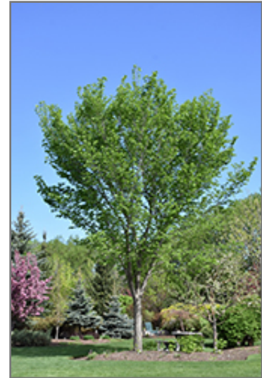
Brandon Elm