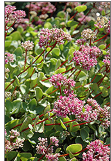
October Daphne flowers