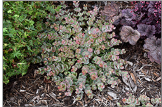
October Daphne

October Daphne is recommended for the following landscape applications;