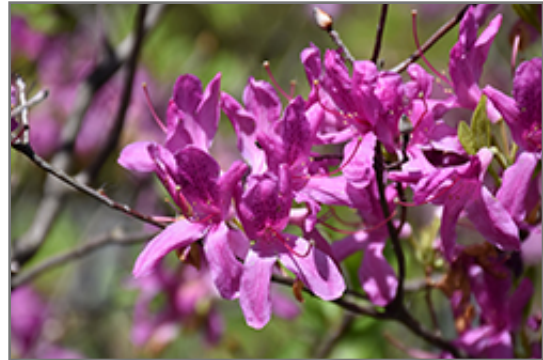
Lilac Lights Azalea flowers