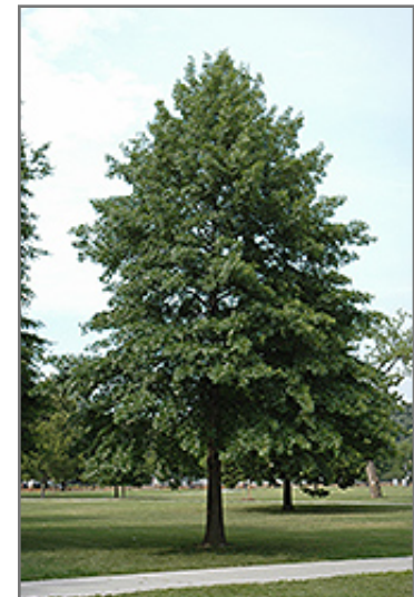
Pin Oak