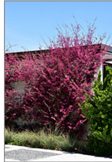
Red-Flowered Chinese Fringeflower in bloom

This shrub does best in full sun to partial shade. It prefers to grow in average to moist conditions, and shouldn't be allowed to dry out. It is particular about its soil conditions, with a strong preference for rich, acidic soils. It is somewhat tolerant of urban pollution. Consider applying a thick mulch around the root zone in winter to protect it in exposed locations or colder microclimates. This is a selected variety of a species not originally from North America.