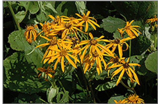
Othello Rayflower flowers